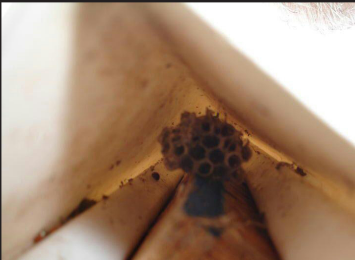
Stay alert for Stinging Insects nests.

STOPS · BATS · MICE · RATS · SQUIRRELS · BIRDS · SNAKES · STINGING INSECTS