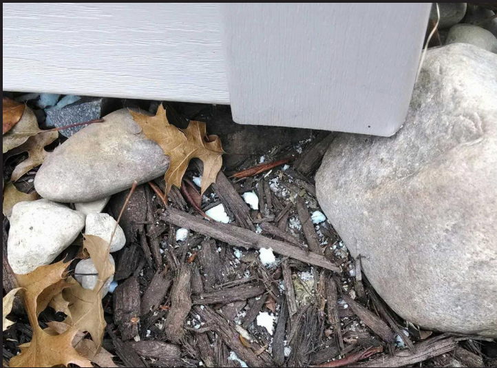
Look for signs of chewed insulation.