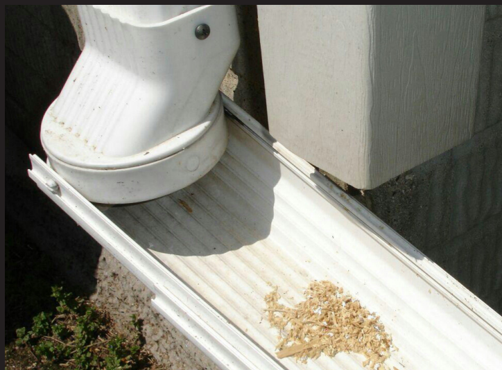
Look for signs of chewed siding.