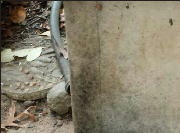
Look for critter “smudges”, animal hair, fur, or other signs.